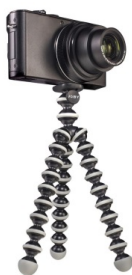
Joby Gorilla pod $25