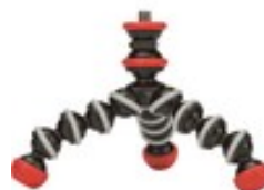
Joby Gpot Mini Magnetic $14