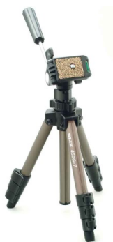
Slik 450G $47